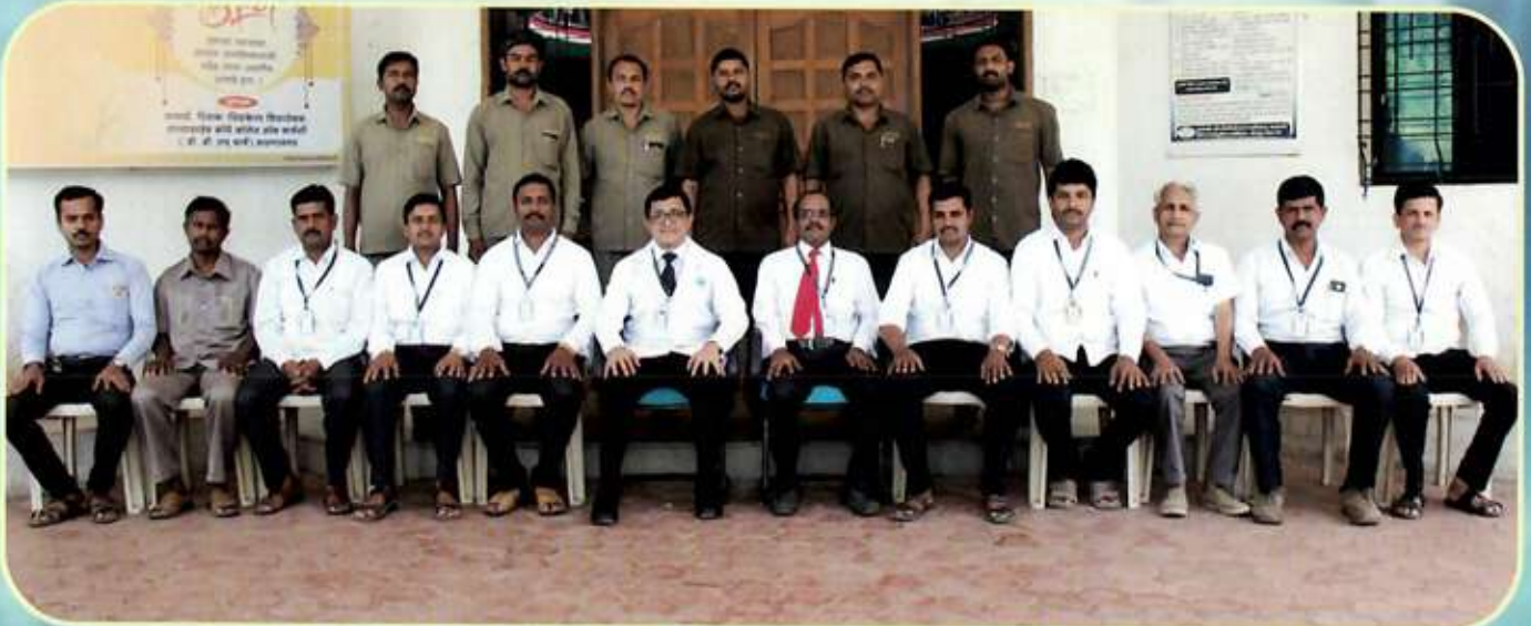
Non Teaching Staff