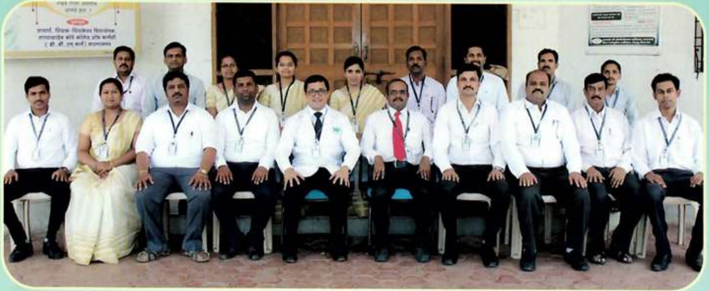
Teaching Staff B. Pharm, M. Pharm & D. Pharm