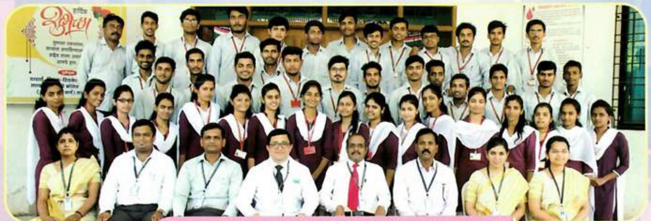
Outgoing Batch - D. Pharmacy