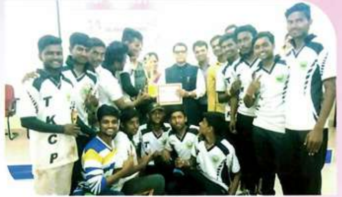
Winner : SKS Pharma sports Cricket Championship 2017-18