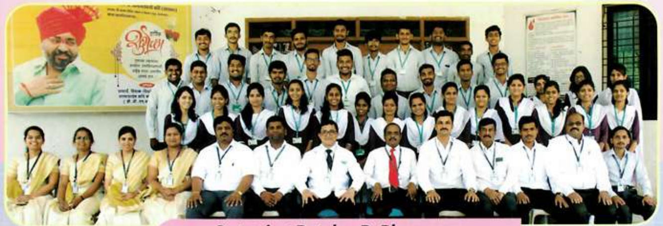
Outgoing Batch - B. Pharmacy