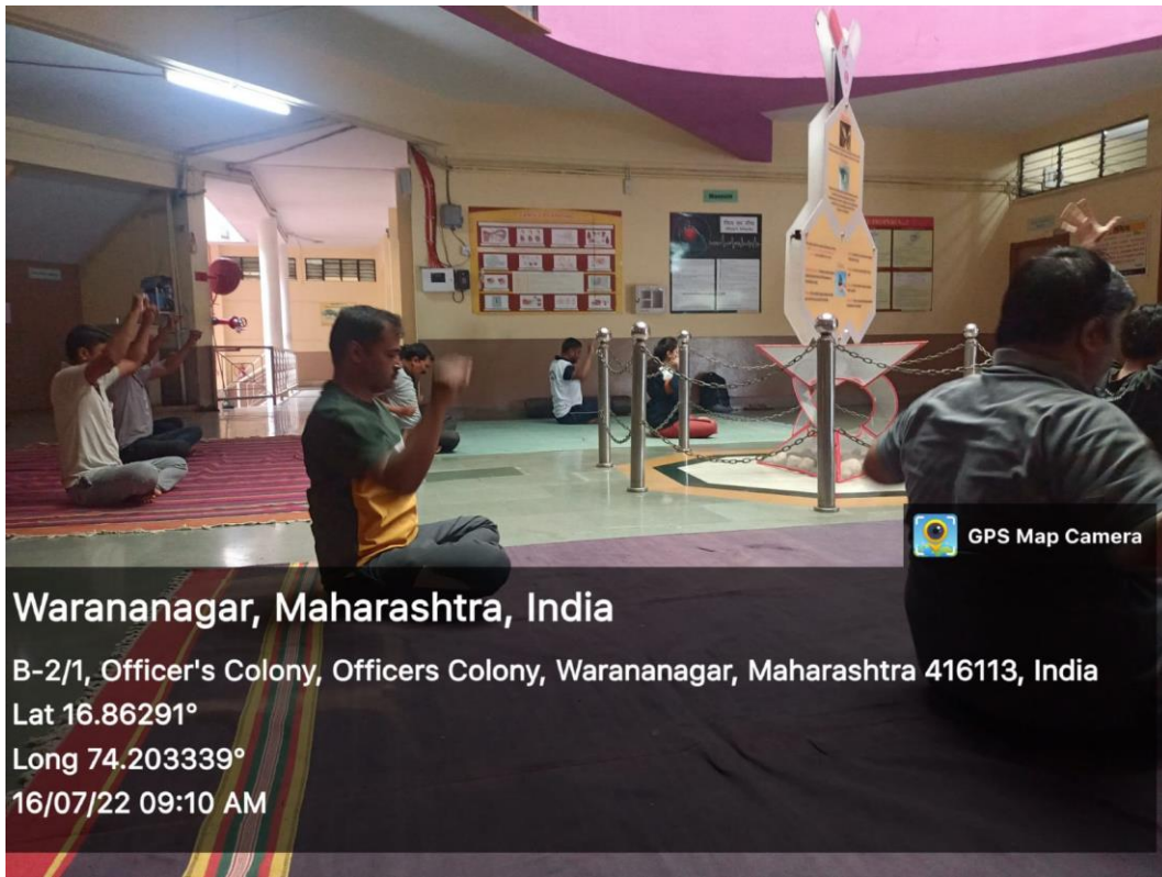
International Yoga Day for Two months on every Saturday (16/07/2022)