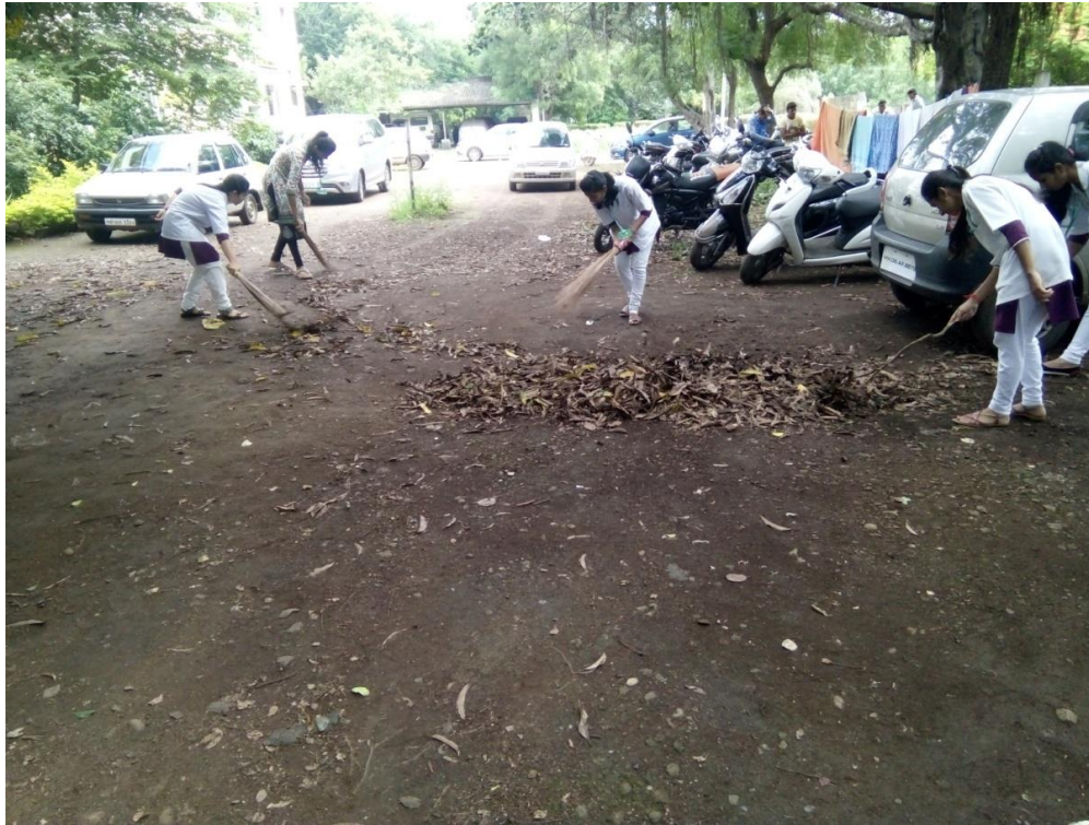
Swachha Bharat Abhiyan Cleaning of College campus (15/09/2022)