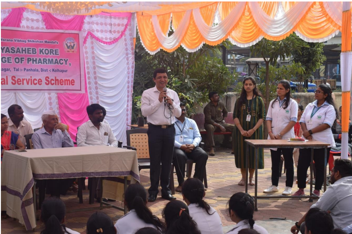
NSS Special Camp at Kakhe, Tal- Panhala, Dist- Kolhapur (01 to 07/02/2023)