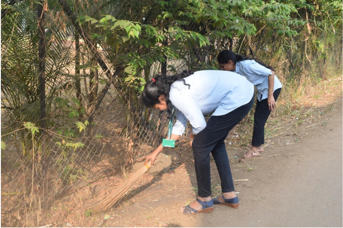
Swachcha Bharat Abhiyan Village cleaning at NSS Special Camp in Kakhe, Tal- Panhala, Dist- Kolhapur (01 to 07/02/2023)