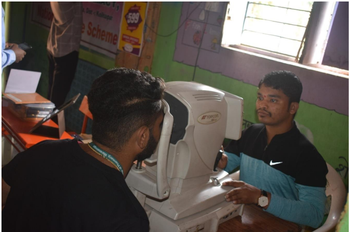
Eye Check-up camp at NSS Special Camp in Kakhe, Tal- Panhala, Dist- Kolhapur (03/02/2023)