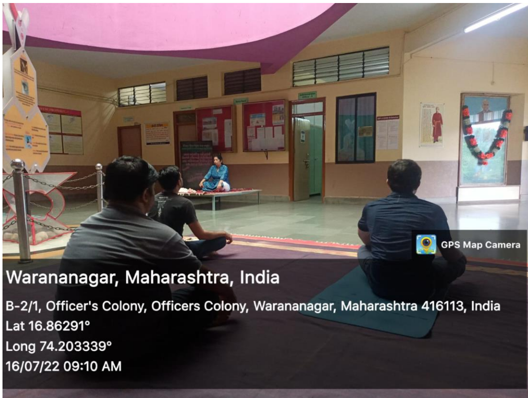
International Yoga Day for Two months on every Saturday (16/07/2022)