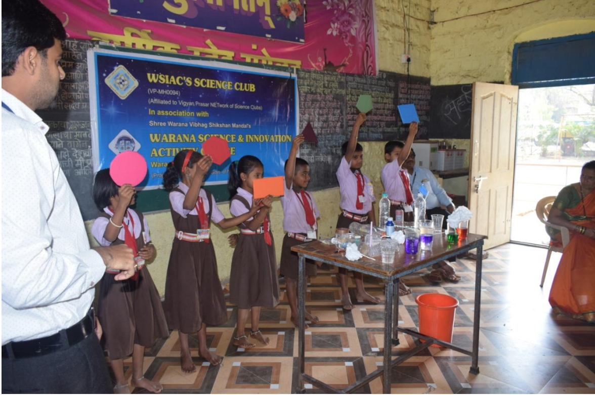
Science based activity 'Chala Vidnyan Shikuya' to school students of Kakhe primary school (04/01/2023)