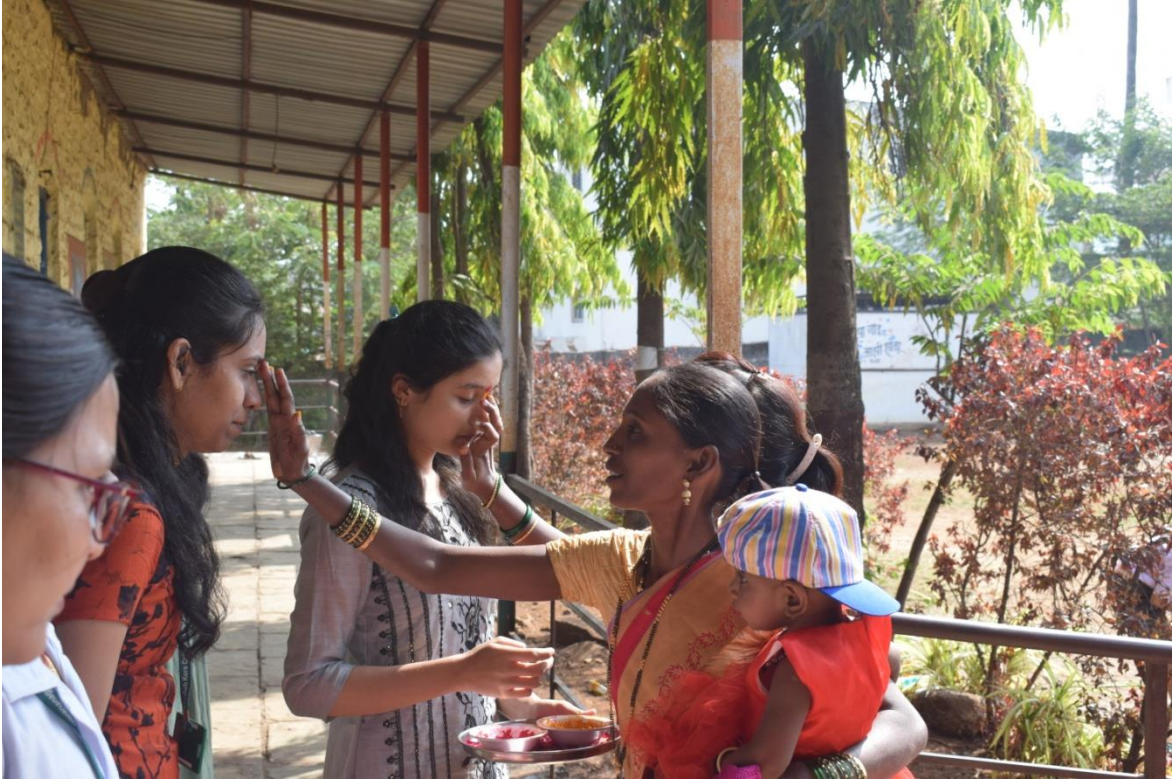
‘Woman’s Haldi-Kunku’ function at Kakhe village (04/01/203)