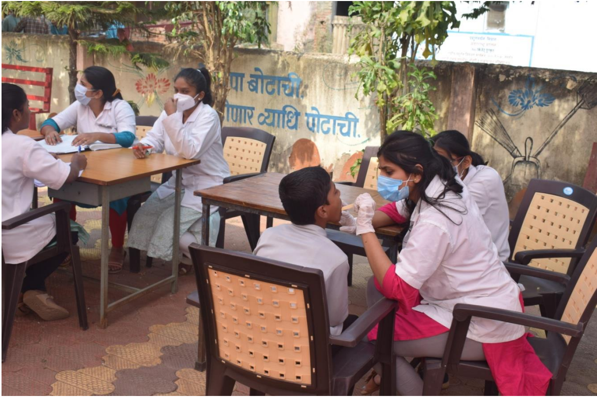
Dental Check-up camp at NSS Special Camp in Kakhe, Tal- Panhala, Dist- Kolhapur (02/02/2023)