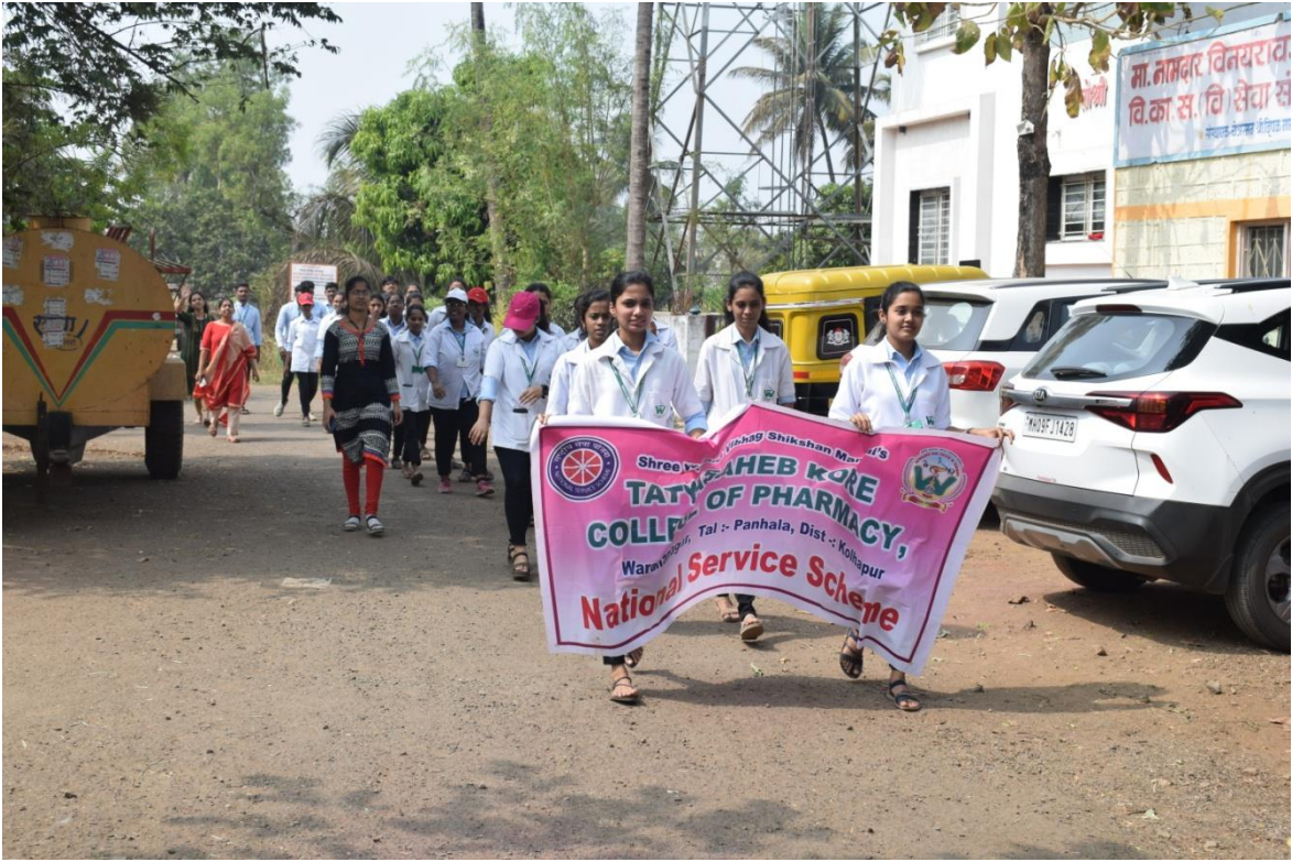
AIDS and Health Awareness rally at NSS Special Camp in Kakhe, Tal- Panhala, Dist- Kolhapur (01 02/2023)