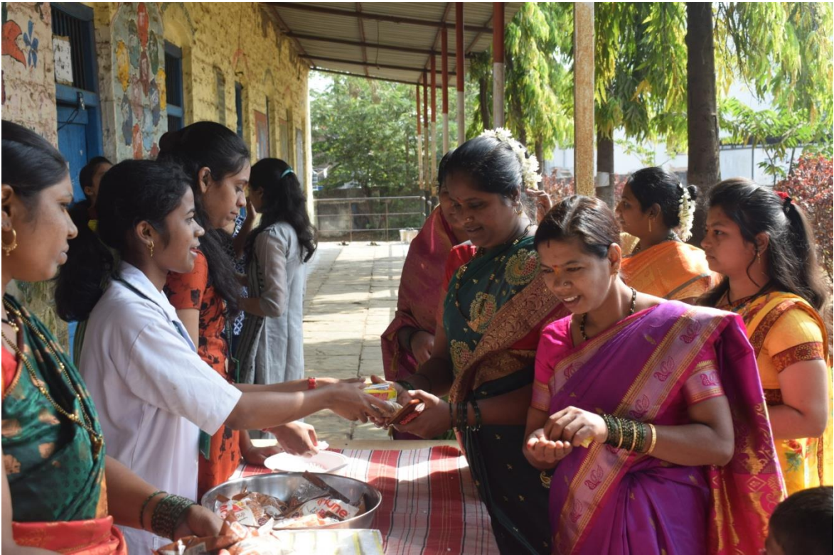
‘Woman’s Haldi-Kunku’ function at Kakhe village (04/01/203)