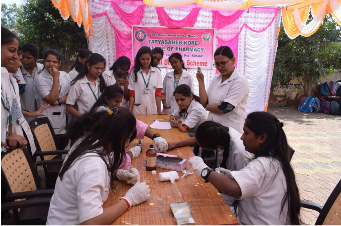
Blood group and Haemoglobin detection camp at NSS Special Camp in Kakhe, Tal- Panhala, Dist- Kolhapur (01 02/2023)