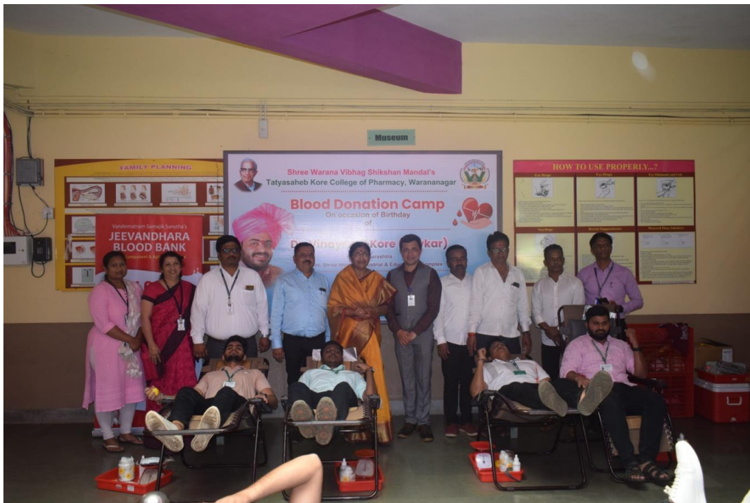
Blood donation camp (04/10/2022)