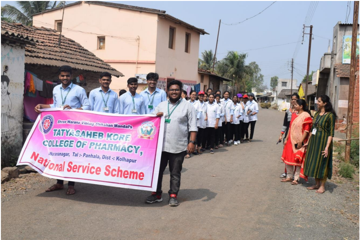
AIDS and Health Awareness rally at NSS Special Camp in Kakhe, Tal- Panhala, Dist- Kolhapur (01 02/2023)