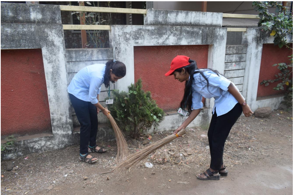
Swachcha Bharat Abhiyan Village cleaning at NSS Special Camp in Kakhe, Tal- Panhala, Dist- Kolhapur (01 to 07/02/2023)