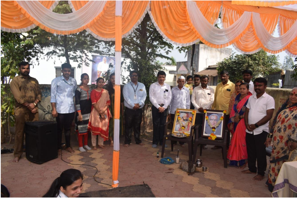
NSS Special Camp at Kakhe, Tal- Panhala, Dist- Kolhapur (01 to 07/02/2023)