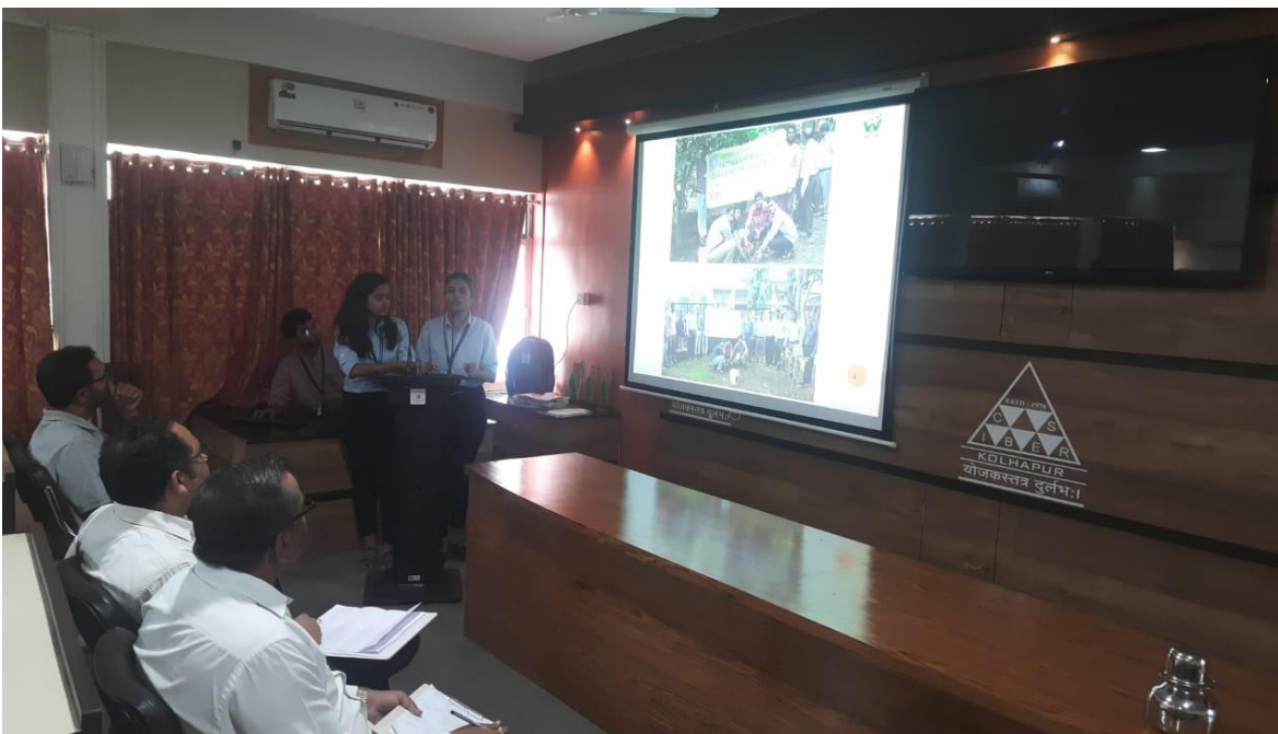
Participation in 'Green College, Clean College' Competition organised by Kirloskar Vasundhara Eco Rangers (20/01/2023)