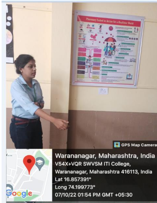
World Pharmacist Day Poster presentation, Rangoli Sub- Pharmacy united in action for a healthier world. AIDS awareness and prevention (07/10/2022)