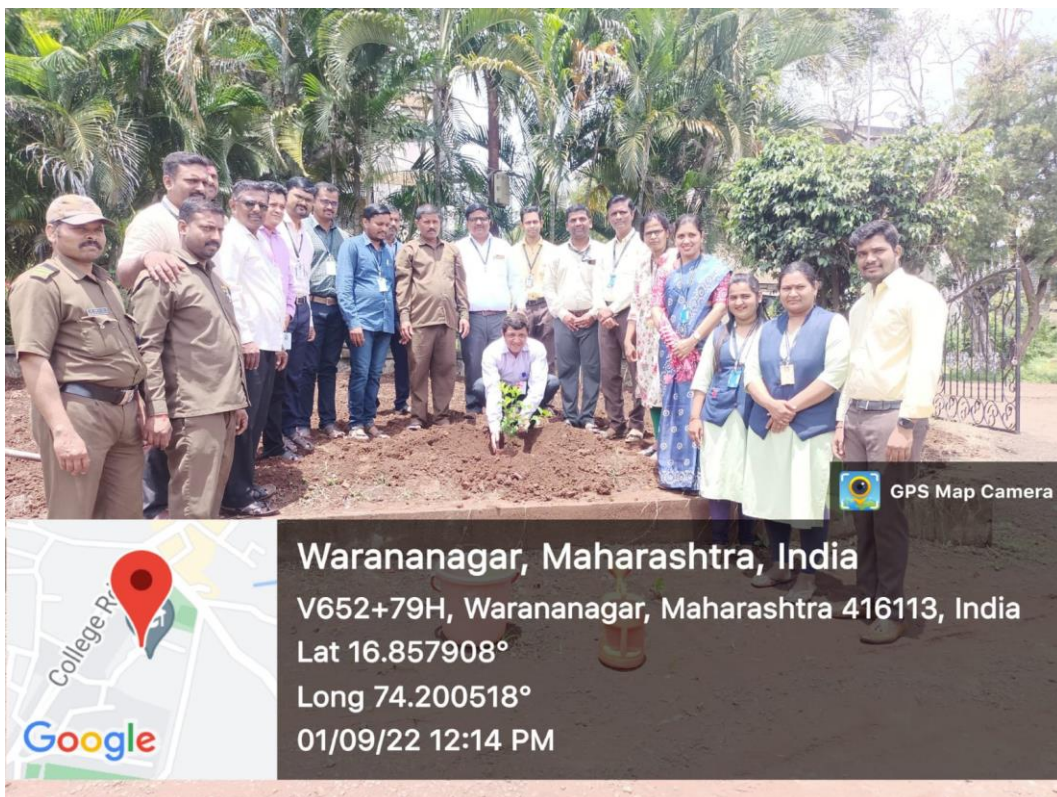
Tree Plantation drive (01/09/2022)