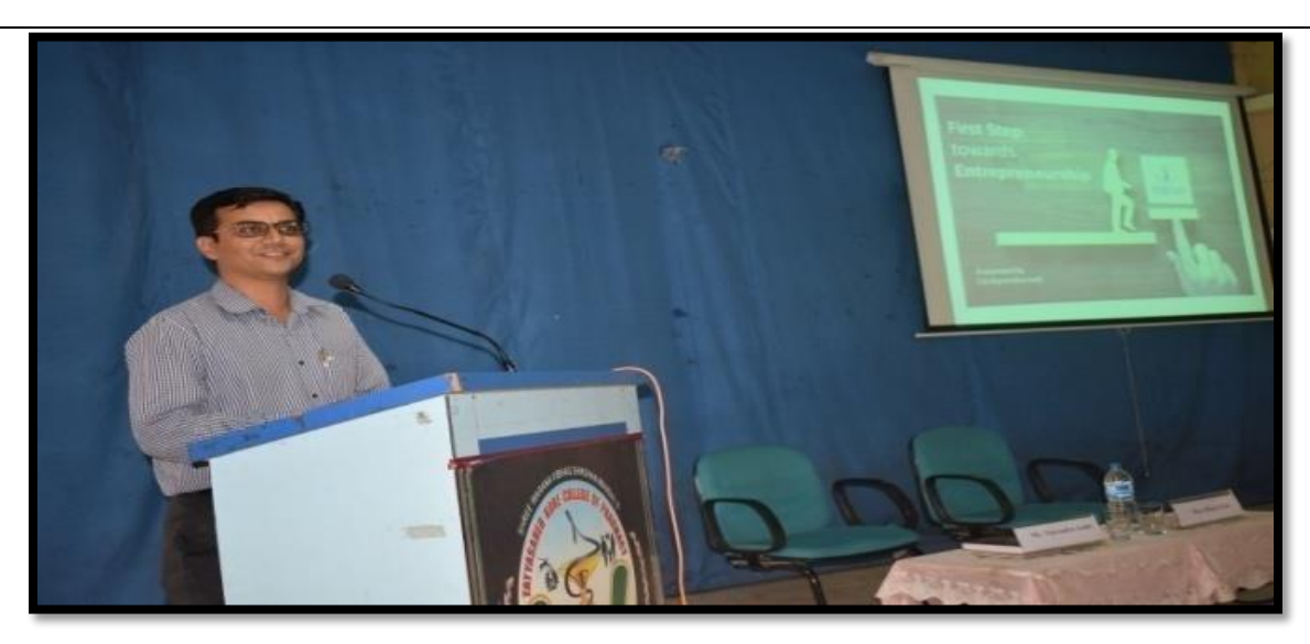
Personality development and Interview Skills by Lokmat Team 26/02/2019