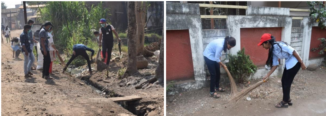
Swachha Bharat Abhiyan