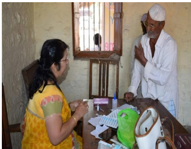
Distribution of medicine and Counselling