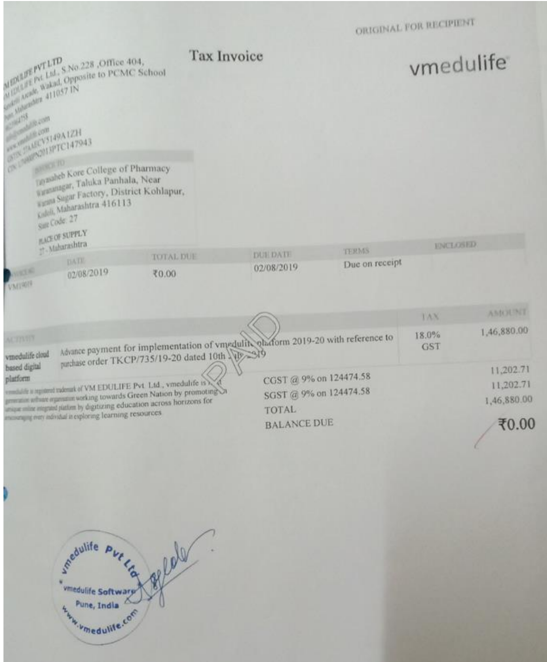
Vmedulife software payment receipt