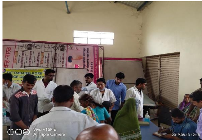
Village Cleaning under Swachha Bharat Abhiyan