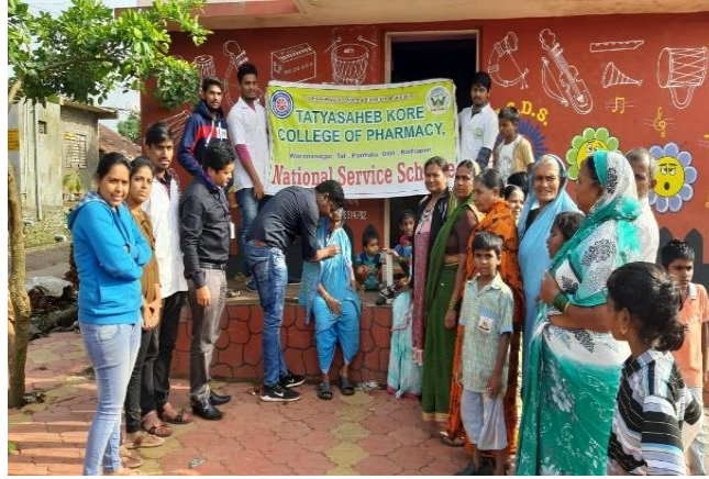
Flood Relief Camp