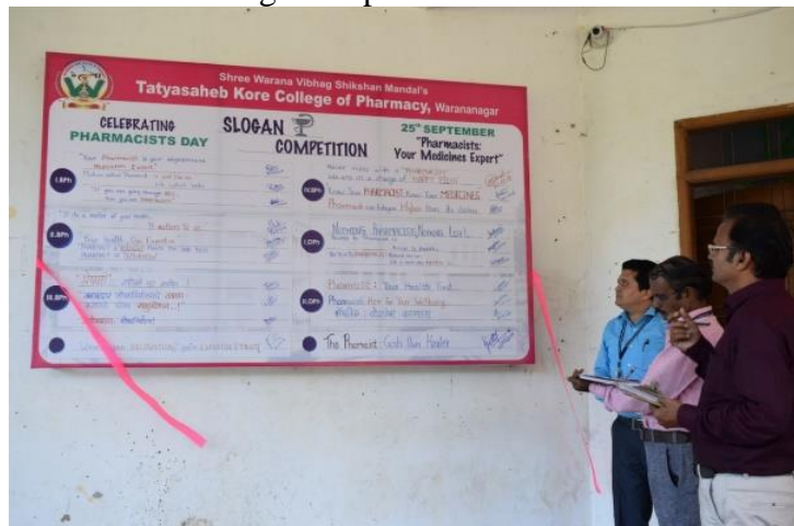
World Pharmacist Day Essay Writing Competition, Slogan competition, T-shirt design competition and Elocution competition