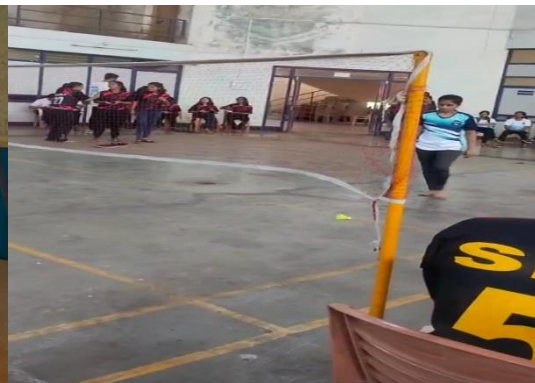
Active participation in sports