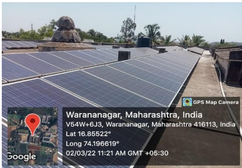
Solar and Bio Renewable Energy System