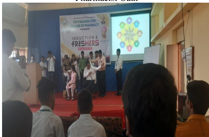
White coat Adorning to newly Admitted students