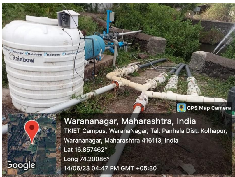
Pumping system for recirculation of collected waste water