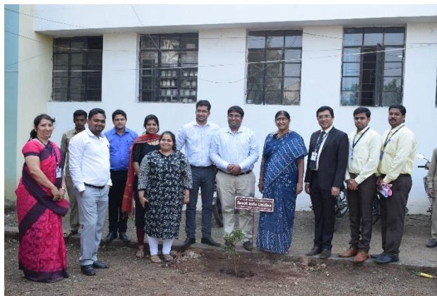
Tree plantation in memory of visit of Sanofi India Ltd. HR team for Pool Campus Drive held on 11 th January, 2019