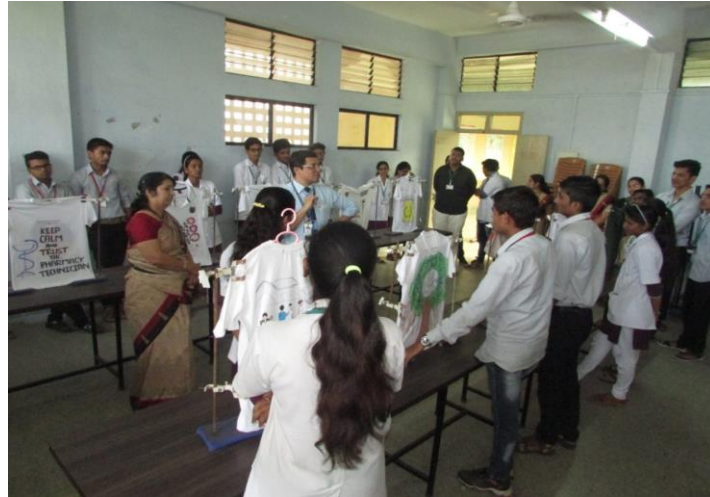
T-shirt design competition on World Pharmacist day