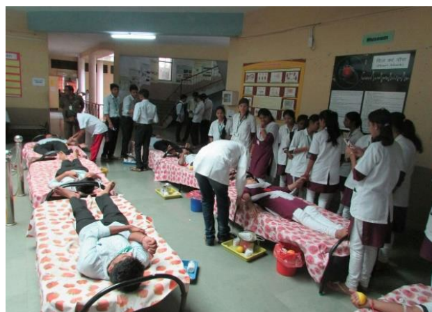
Blood Donation camp and Blood Group Detection Camp