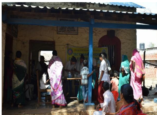
Haemoglobin Detection Camp