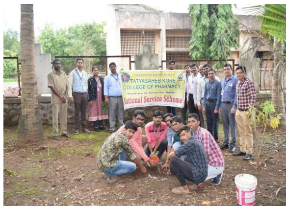
Herbal Medicinal Garden plantation on 12 th December, 2018