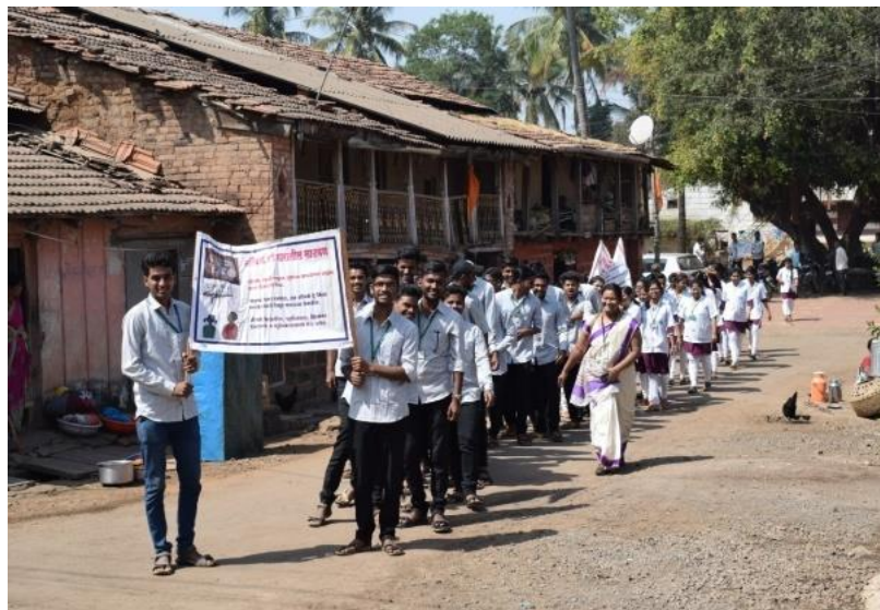
Awareness Rally in villages for rational use of medicines