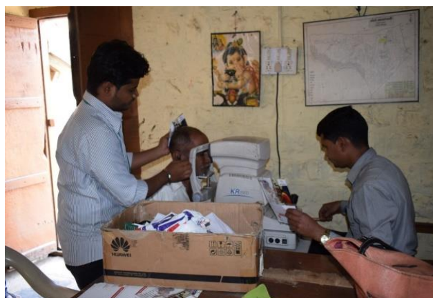
Eye checkup camp