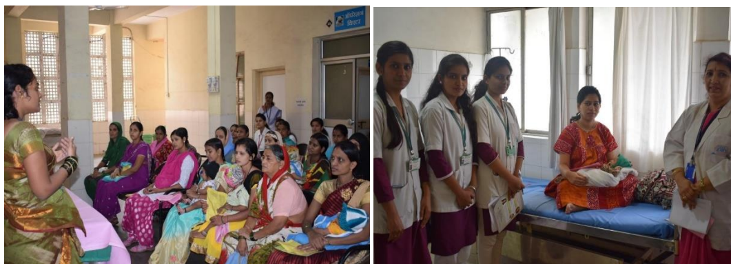
Breast feeding awareness program